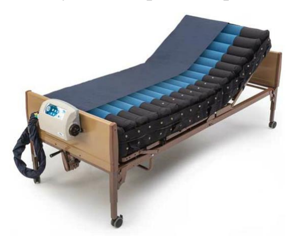
The 2 designs above do not have repositioning features which was the main goal of our design.

- Low air loss mattress: look similar to our design, material of the cells allow air escape to keep the contact surface dry while air circulates periodically remove pressure points.